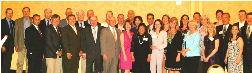
Alumni and Faculty of the Department of OB-GYN