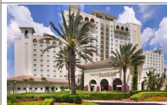
Omni Orlando at ChampionsGate May 11-13, 2012